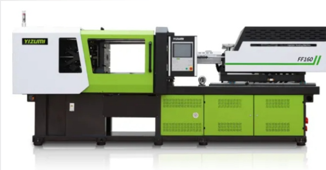
Yuzumi - 160 Ton