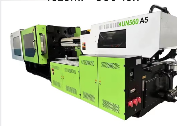
Yuzumi - 560 Ton