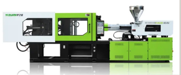
Yuzumi - 280 Ton